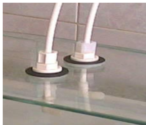
Fig.3: Holders arrangement in the dynamic chamber

In this study, 48 samples were prepared and tested as follows: 24 samples from marine coral powder