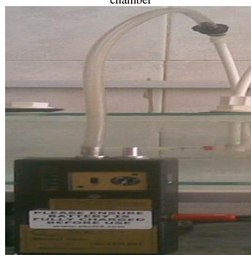
Fig.4: Air sampling train and adsorbent tubes arrangement followed by sampling holders

and 24 others by activated charcoal. The mean adsorption capacity of the used hydrocarbons by activated charcoal and marine coral powder was obtained 50.87 and 1.53, respectively (Table 2).