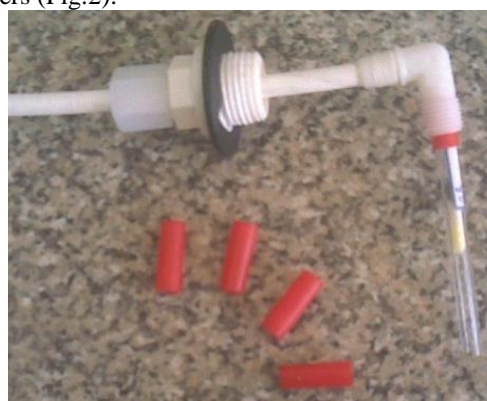
Fig.2: Sampling holders designed for dynamic chamber sampling

The marine corals were obtained from the south coasts of Iran. In order to the marine coral pretreatment, washing with methanol (3 times) and heating (1h; 70°C) to evaporate water, pollution elimination and pore expansion were used. Then massive marine coral were ground and sieved through a 20/40mesh screen. 0.15g marine coral was packed at a glass tube similar to charcoal tube (7 cm L, 4mm ID.) followed by end capping with holders (Fig.2).