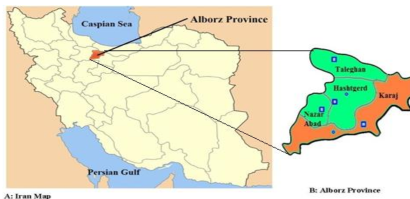
Fig. 1: Location of the studied region (Karaj city)

Karaj city with 162 square kilometers situated near Tehran city (capital of Iran), It is located in the center part of Iran at an altitude of 35°12' to 35°21' north and longitude of 50°18' to 51°26' east. This city has enclosed by Alborz mountain ranges in north and internal plains of Iran plateau in the south. According to the last census, Karaj city with a population over than 1900000 was the 5th populated city in Iran. After Tehran city, this city has the most immigration among the Iranian cities. Karaj city has many environmental air pollution potentials. It can be due to the specific location of Karaj city which is located near to highway connecting to the western parts of Iran, as well as vicinity to the capital of Iran and having so many factories and industrial area. So investigating the health impacts of air pollutants such megacities looks remarkable [19].